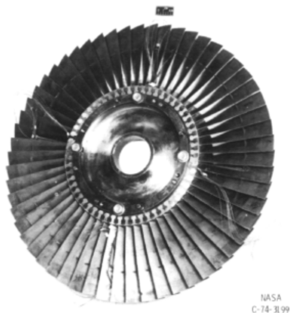
Fig. 1 https://catalog.archives.gov/id/17423368