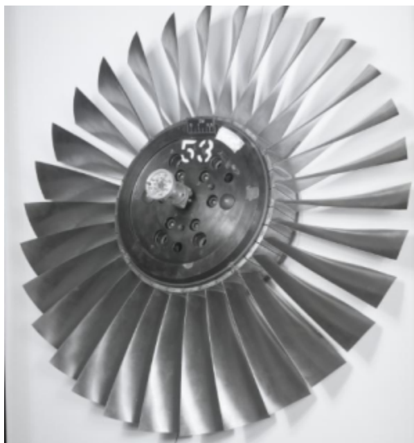
Fig. 1 https://catalog.archives.gov/id/17423389