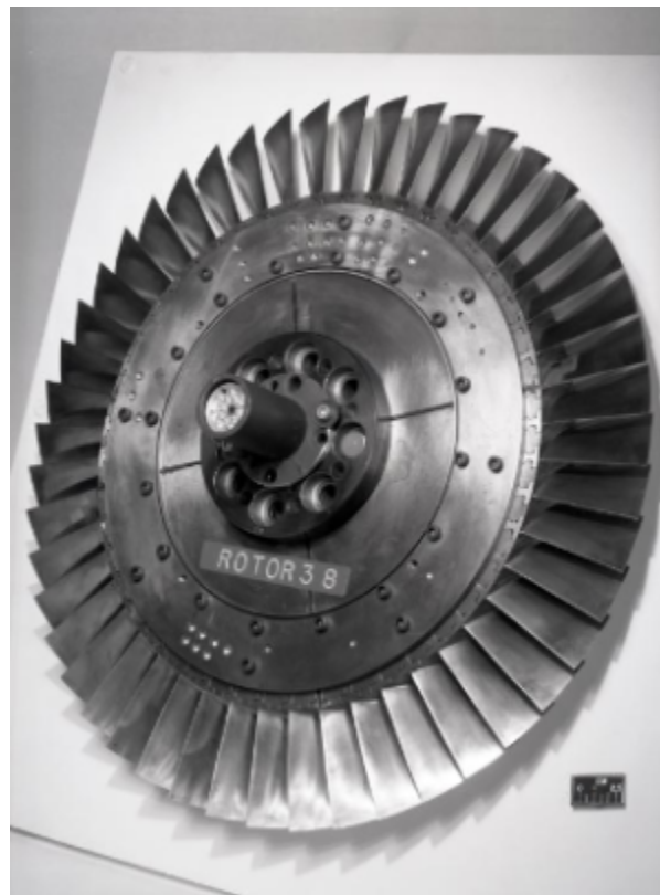
Fig. 1 https://catalog.archives.gov/id/17466806