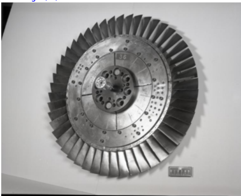
Fig. 2 https://catalog.archives.gov/id/17467884