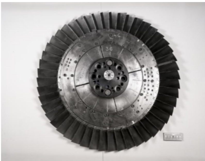
Fig. 1 https://catalog.archives.gov/id/17467913