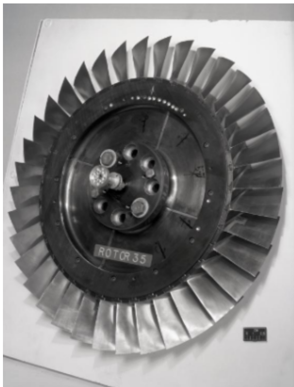
Fig. 1 https://catalog.archives.gov/id/17466807